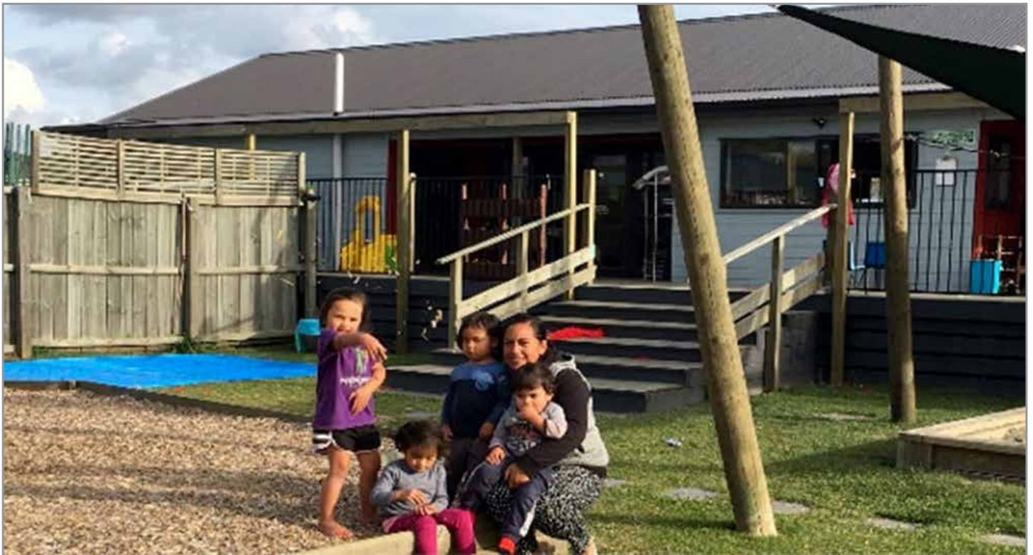
Ruiha Christie Centre manager with tamariki

As part of its strategic plan to increase its business value and invest significantly in the education future of its tamariki mokopuna, in April 2015 Ngati Tarāwhai officially opened its purpose-built early childhood centre, Te Puna Reo o Puāwai in Pohutukawa Drive, Owhata.