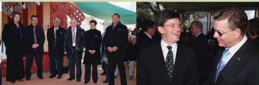
Staff of Te Pumautanga O Te Arawa Trust