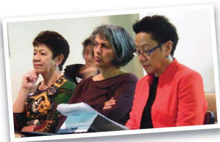
Beneficiaries at the hui in Wellington

Both settlement legislations were enacted in September 2008. The significant size of the combined settlements meant that the assets transferred in July 2009.