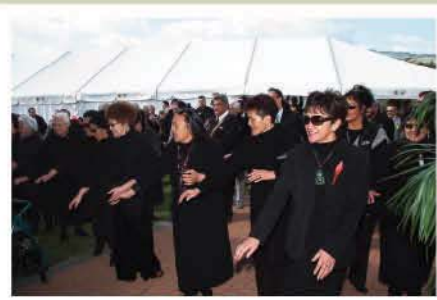
Te Arawa celebrating