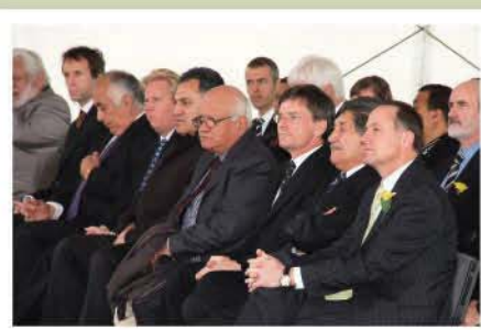
The Crown representatives