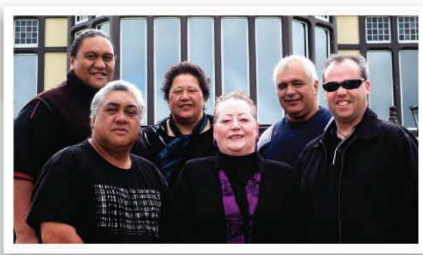
Trustees of Te Roro o Te Rangī Hapu Trust

“We can determine our future, fulfil the dreams of our koroua and kuia, and educate our children to stand tall in this world.”