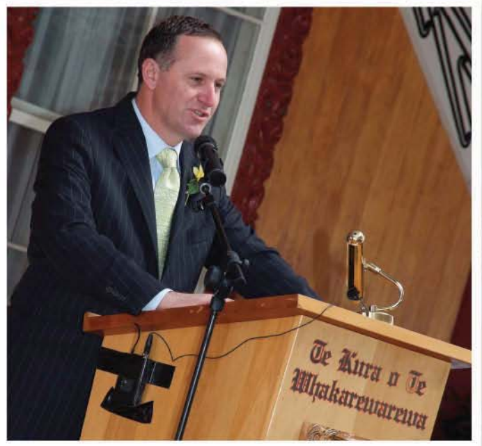
Rt Hon John Key delivering Crown Apology